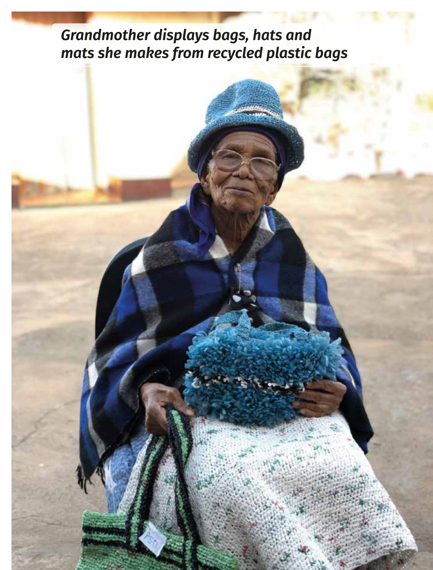
Grandmother displays bags, hats and mats she makes from recycled plastic bags

Kgatleng District Grandmothers, September 2021 Epidemiological Facts Sheets on HIV/AIDS and Sexually Transmitted Infections 2004. (WHO, UNICEF, UNAIDS). Stephen Lewis Foundation https://oneworldgrandmothers.ca/2021/08/01/botswana/ https://www.unhcr.org/innovation/grassroots-orhanisations-are-just-as-important-as-seed-m-money-for-innovation/ Report on Violence Against Children National Survey on Life Experience and Risk of HIV Infection Among 13-24 Year Old Males and Females in Botswana (Ministry of Local Government 2019)