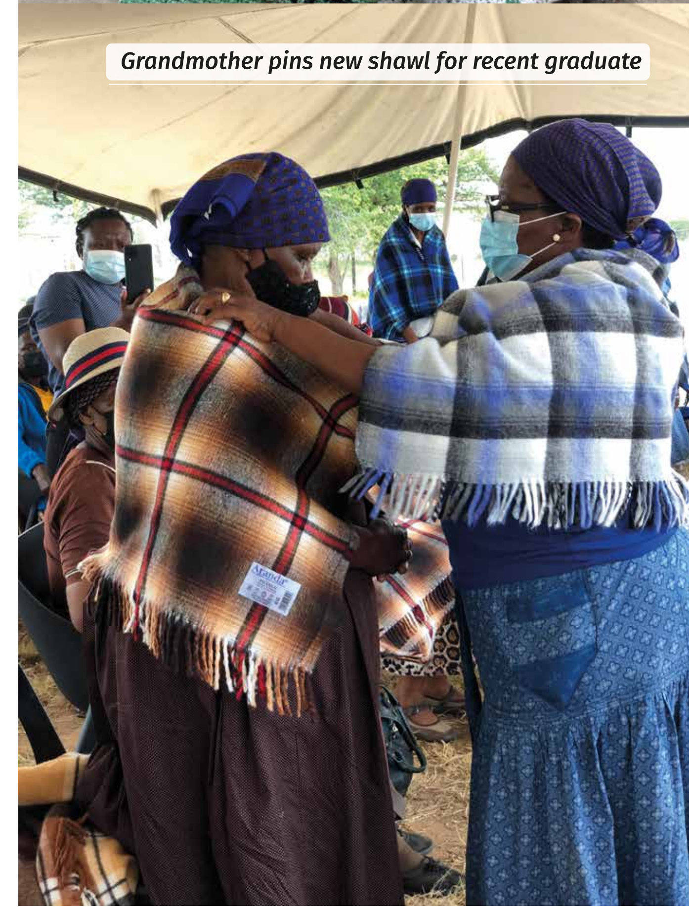
Grandmother pins new shawl for recent graduate

After a training on sexual abuse, a young girl approached the grandmother saying,