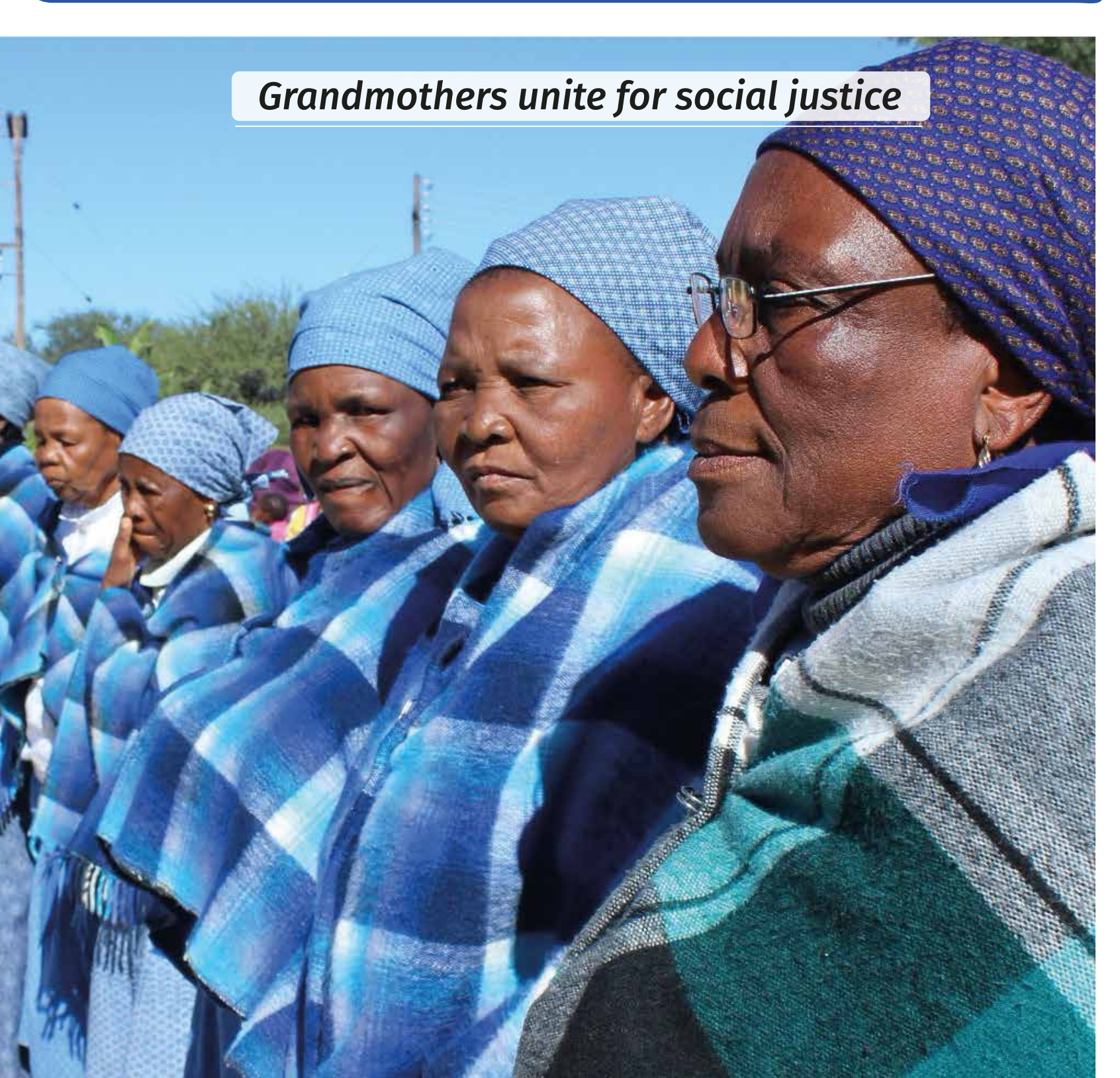
Grandmothers unite for social justice